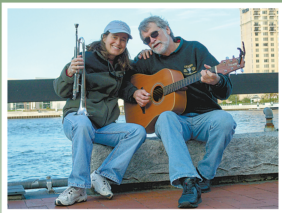
Sound Travelin' with Sound Traveler on River Street in Savannah, Georgia.